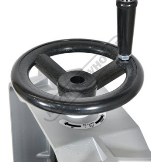
Handle For Height Adjustment