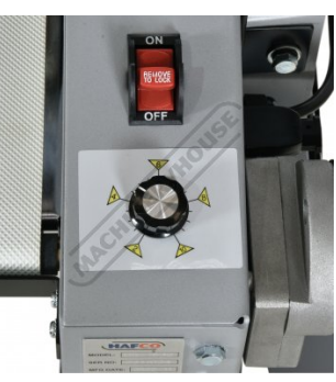
Variable Speed Dial