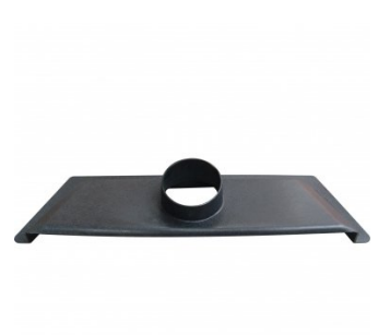
W338 Dust Hose Universal Dust Hood