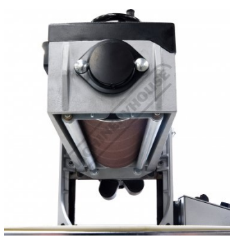
Sanding Wheel with Rollers