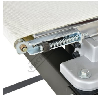
Belt Tension Adjustment