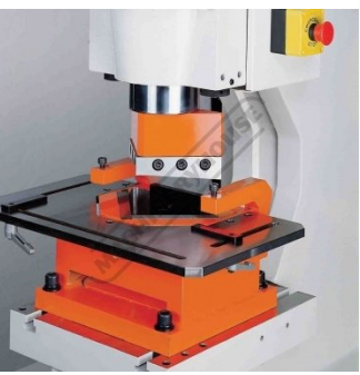
Optional Vee Notcher Punch Side