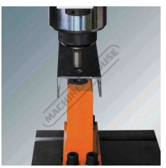
Optional Channel Punching Die Holder