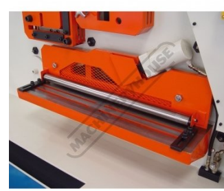
Optional Hydraulic Holddown for Flat Shear Optional Pipe Notcher