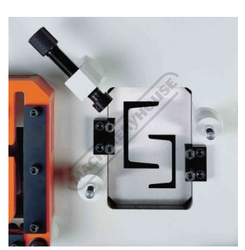
Optional Channel Shear