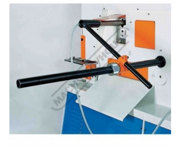
Includes Auto Touch & Cut Length Stop