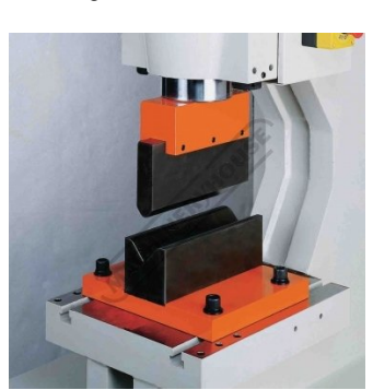
Solid Punching Base With T-Slot Grooves Optional Single Vee Pressbrake Attachment Optional Multi Vee Preesbrake