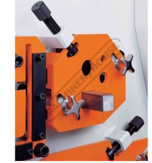
Square Bar Shear