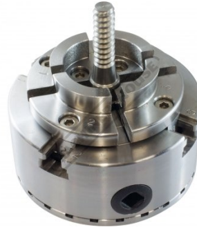
Shown With Wood Screw