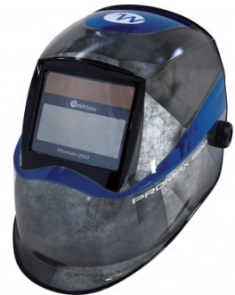
W001 Auto Darken Welding Helmet - 9-13 Shade