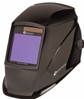
W003 Auto Darken Welding Helmet - 5-8 / 9-13 Shade