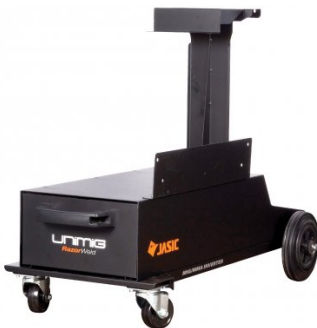
W179A Welder Trolley