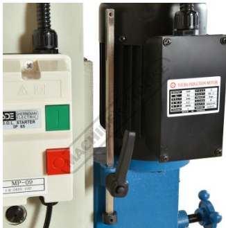
Adjustable depth stop