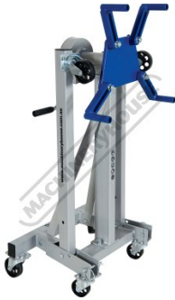
Fold Up Legs