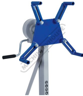
Adjustable Engine Mounting Plate