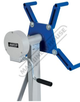
Handle For Geared Rotating Head