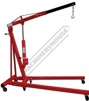
A350 Hydraulic Engine Crane