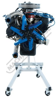
Front View With Engine Mounted