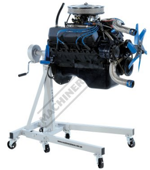
Shown With Engine Mounted