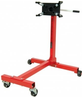
A341 Engine Stand - 450kg Capacity