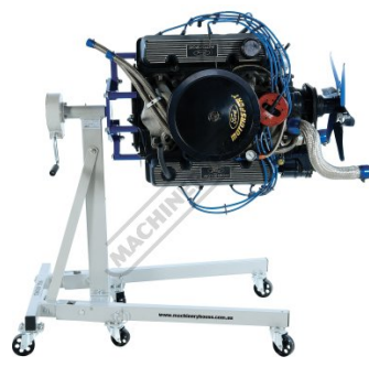
Engine Rotated 90 Degrees