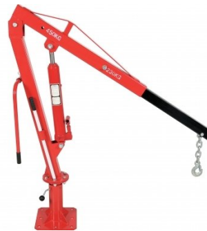
A353 Swivel Crane - Truck or Ute