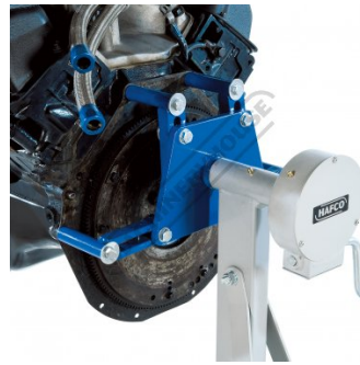
Mounting Positions On Engine