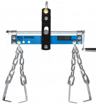
A3425 Engine Tilter - Heavy Duty