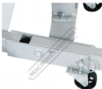
Locking Pin For Legs