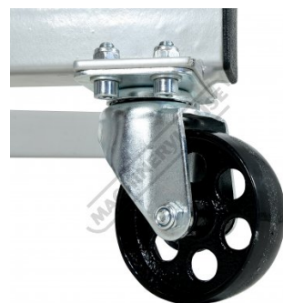
Swivel Caster Wheels