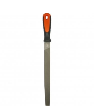
F124 Engineers File, Half Round Coarse Cut