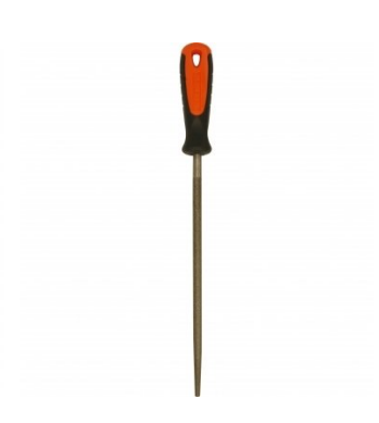
F128 Engineers File, Round - Second Cut