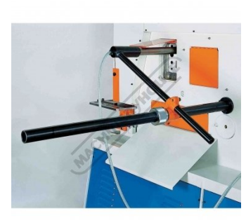
Includes Auto Touch & Cut Length Stop