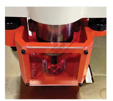
LG-PS - Laser Guide System