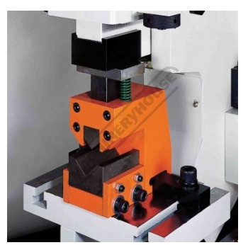
Optional Angle Bending Press