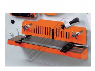
Flat Bar Shear