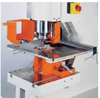
Includes large hole punching up to 50mm Diameter