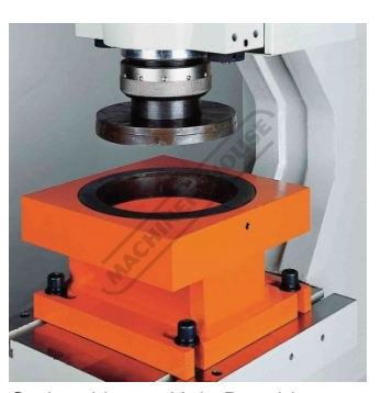
Optional Large Hole Punching