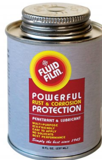
O043 Rust & Corrosion Preventive - Penetrant & Lubrication