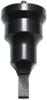
P6001 8 x 8mm Square Punch