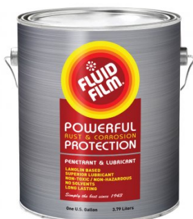
O044 Rust & Corrosion Preventive - Penetrant & Lubrication