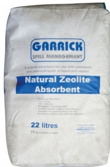
O000A Natural Zeolite Absorbent