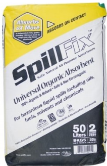
O000 SpillFix Universal Organic Absorbent