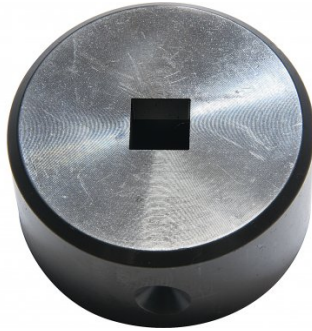
P6002 8.7 x 8.7mm Square Die