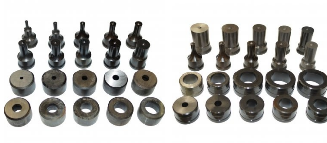
P726 Ø26mm Round Punch - RPN1