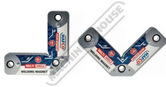
Multi Angle Magnets