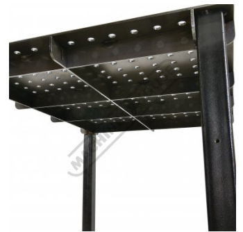
Rib Design for Strength