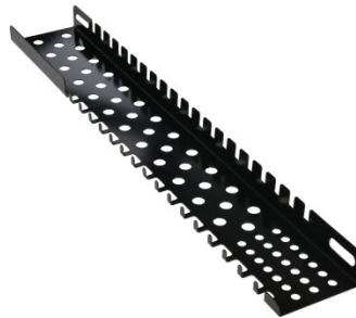
W08524 Welding Clamp Tool Tray