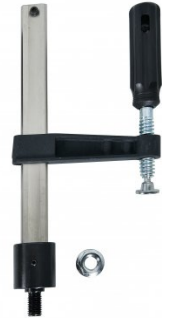
W08511 2 x Weld Clamps with Locking Nuts