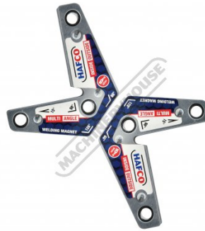
Multi Angle Magnets