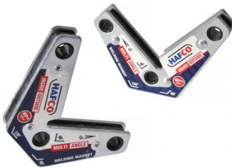
W1082 Multi Angle Corner Magnets