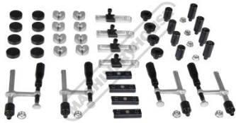
Square & Round Welding Table Clamp Kit