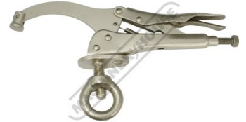
Locking Clamp x 2