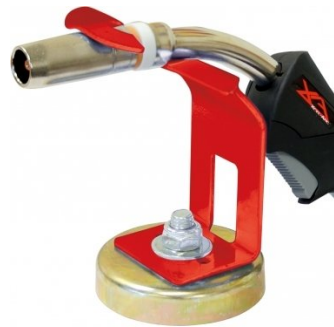
W10362 Magnetic MIG Torch Rest