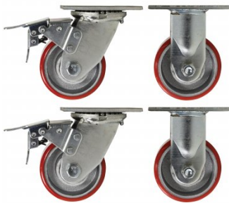
C408 Industrial Caster Wheel Set