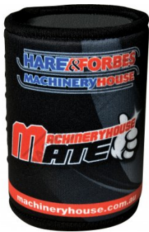
Magnetic Stubby Holder