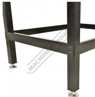
Steel Leg Bracing