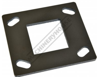
Includes 4 x Base Plates for Optional Castor Wheels