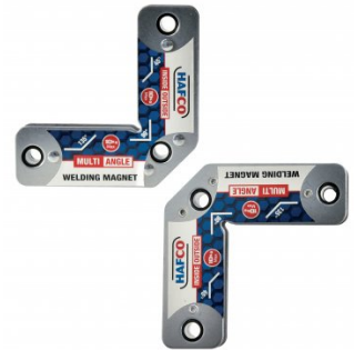
W1081 Multi Angle Corner Magnets