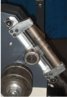
Shown On Machine