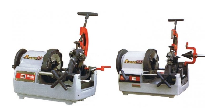
T024A Pipe Threading Machine -Automatic Die Head