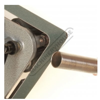
External Pipe Chamfering

sales@machineryhouse.com.au www.machineryhouse.com.au