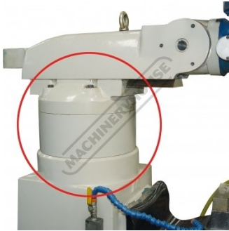
Shown Fitted To Milling Machine