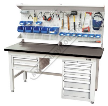
Shown with Extra Optional Accessories

Rounded-bull nosed hard PVC edge Adjustable Feet