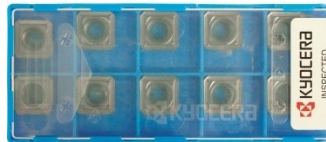
L065 KYOCERA Carbide Inserts - Milling