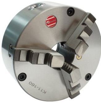
C2806 3 Jaw Self Centring Lathe Chuck