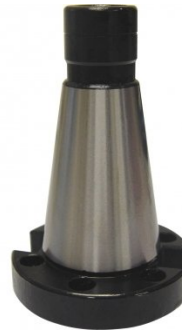
M197A Boring Head Shank