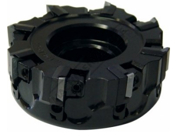
M503 Face Mill 90° - Positive Rake