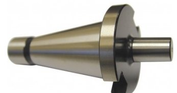
D446 NT40-JT6 Drill Chuck Arbor