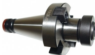
M554 Face Mill Arbor