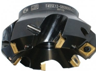
M517 Face Mill 45° - Super High-Rake