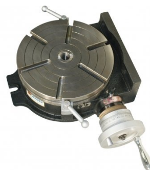
R010 Vertex Rotary Table