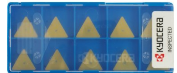
L066 KYOCERA Carbide Inserts - Milling