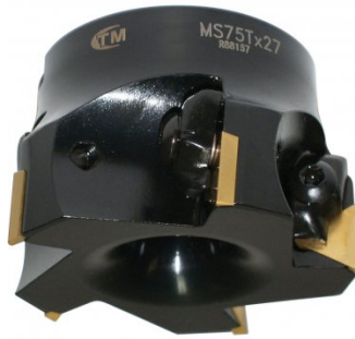
M512 Face Mill 90° - Positive Rake