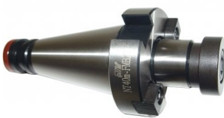
M552 Face Mill Arbor