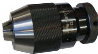
C294 Industrial Drill Chuck - Keyless Type