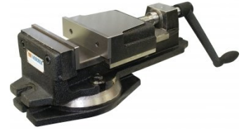
V106 Vertex K-Type Milling Vice