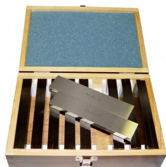
M252 Parallel Set - 18 Piece