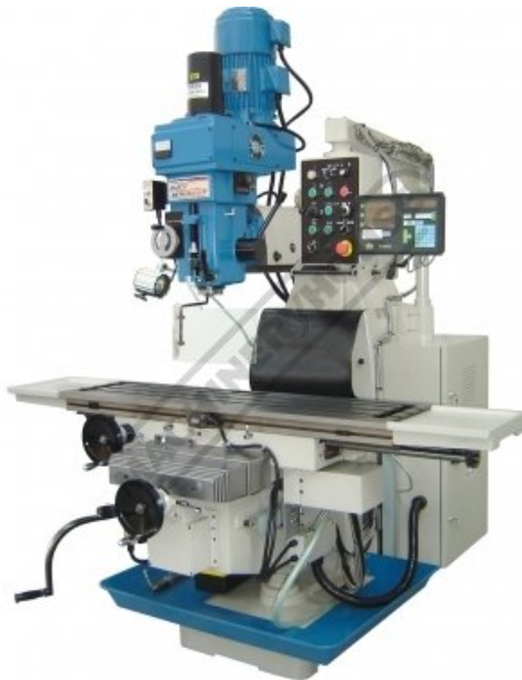
Table Travel: (X) - 1120mm (Y) - 520mm (Z) - 360mm Includes Digital Readout System, Servo Driven Ballscrew System X & Y-Axis & Pneumatic Brawbar System