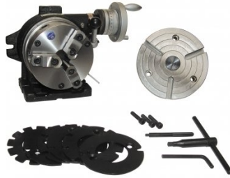
R002 Vertex Super Indexing Head