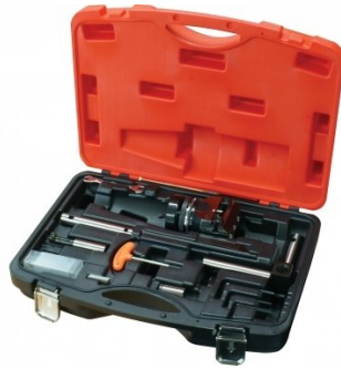
M185 Precision Universal Facing & Boring Head