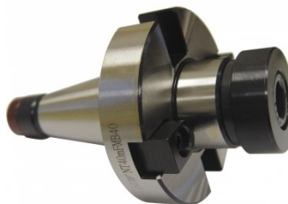
M555 Face Mill Arbor