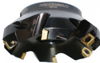
M518 Face Mill 45° - Super High-Rake