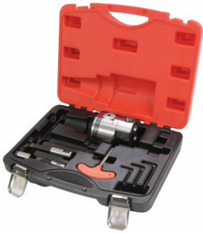
M184 Precision Boring Head