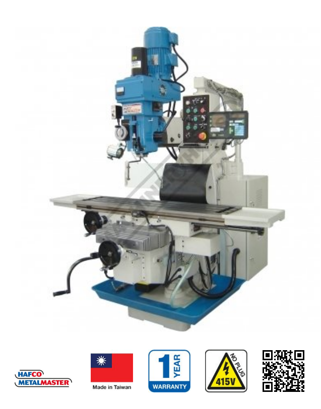
Table Travel: (X) - 1120mm (Y) - 520mm (Z) - 360mm Includes Digital Readout System, Servo Driven Ballscrew System X & Y-Axis & Pneumatic Brawbar System