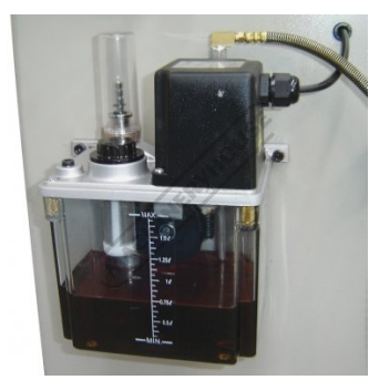
Auto Lubrication System