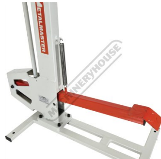
Foot Pedal Lever