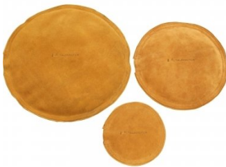
S210 Round Leather Bags - Sand Filled