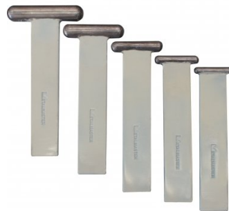
S223 Straight Steel T-Dolly Set Small - 5 Piece