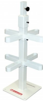
S2238 Steel Dolly Stand