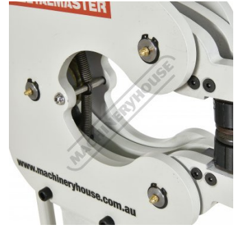
6x Grease Pinots