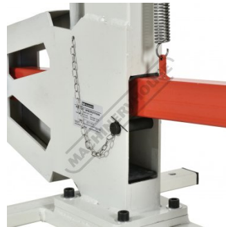
Safety Locking Pin