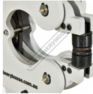
Die Head Close Up