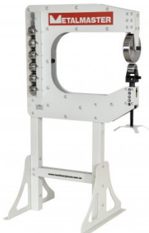
S2252 English Wheel