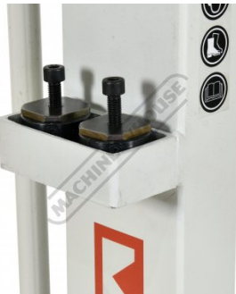
Die Storage Holder