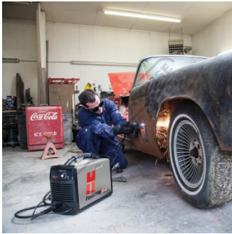
Home Garage Use