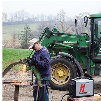
On the Farm