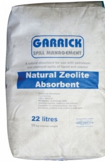
O000A Natural Zeolite Absorbent