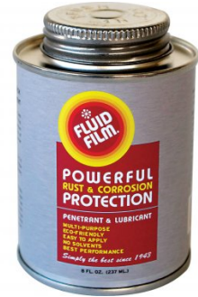
O043 Rust & Corrosion Preventive - Penetrant & Lubrication