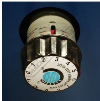
Variable Blade Speed