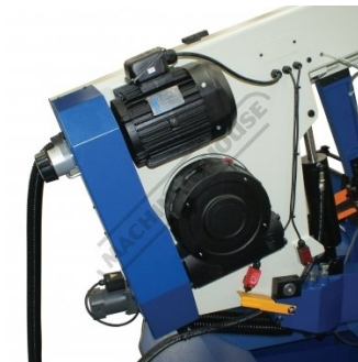
Gearbox and Motor