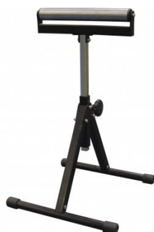
W343A Roller Stand