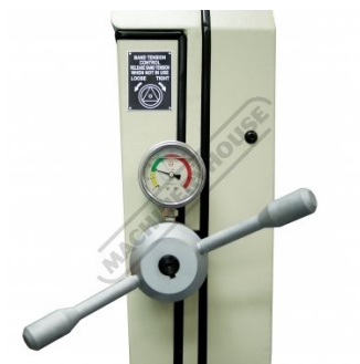
Blade Tension Dial with Gauge