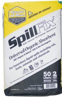
O000 SpillFix Universal Organic Absorbent