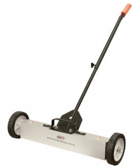
M9991 Magnetic Floor Sweeper