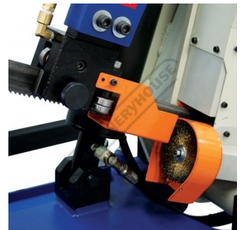
Blade Guides and Blade Cleaning Brush