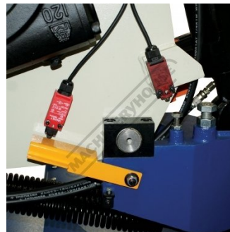
Micro Switches Control on Head