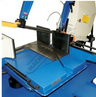
Vice Dual Mitre