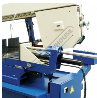
Vice Rear View