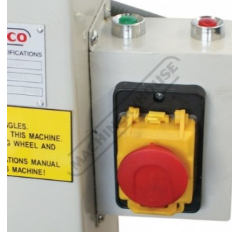
Start & Stop with Emergency Stop