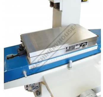
Fine Pole Magnetic Chuck