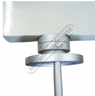
Cross Feed Dial