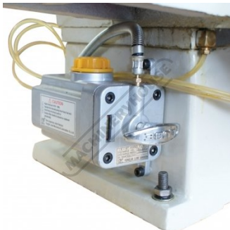
One Shot Lubrication Pump