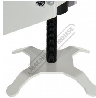
Lower Anvil Cradle Adjustment