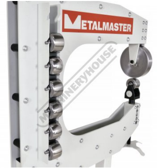
Die Storage Rack