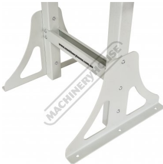
Wide Feet with bolt holes