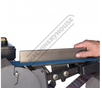
Flat Grinding on Platen