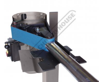
Tilting Table for Contouring and Pipe Notching