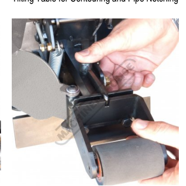
Quick Cartridge Changer