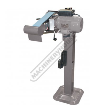
Left View on Stand