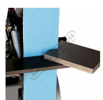
Accurate Tracking Produces Sharp Corners on Quick Release Toolrest Internal Tube De burring