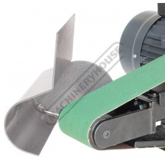
Swing out Guard