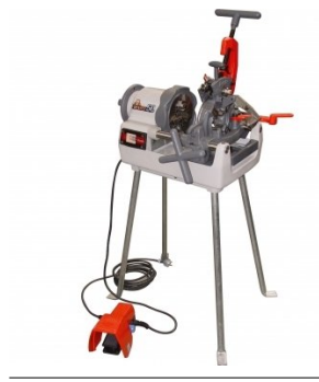
T023 Pipe Threading Machine -Automatic Die Head