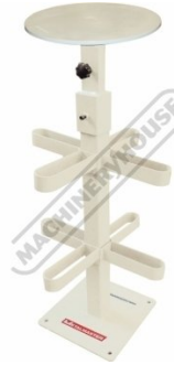
Shown with Optional Stand S2238