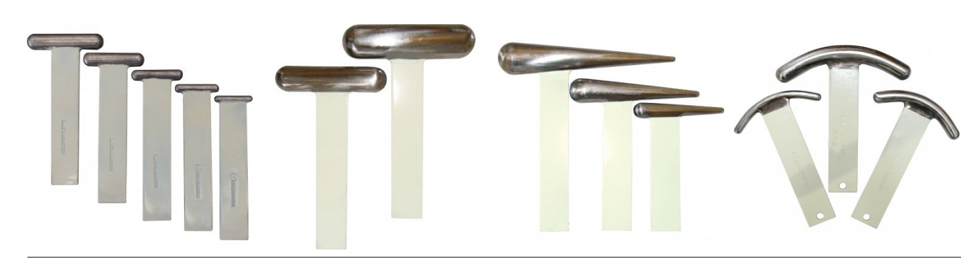
S2233 Curved Steel Dolly Set - 3 Piece

S2232 Tapered Steel T-Dolly Set - 3 Piece