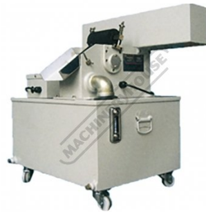
Coolant Pump Tank & Magnetic Separator