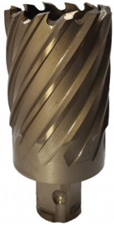
D938A HSS-Co (5% Cobalt) Drill Broach Cutter