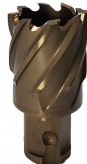
D930 HSS-Co (5% Cobalt) Drill Broach Cutter