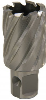
D9528 HSS Drill Broach Cutter