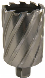
D9582 HSS Drill Broach Cutter