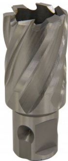
D9525 HSS Drill Broach Cutter