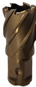
D925 HSS-Co (5% Cobalt) Drill Broach Cutter