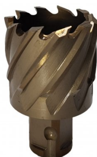
D936 HSS-Co (5% Cobalt) Drill Broach Cutter