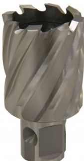
D9532 HSS Drill Broach Cutter