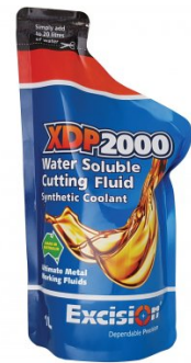
S090A Soluble Metal Cutting Fluid - 1 Litre