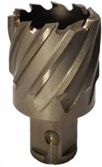
D934 HSS-Co (5% Cobalt) Drill Broach Cutter