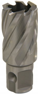
D9524 HSS Drill Broach Cutter