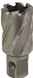
D9526 HSS Drill Broach Cutter