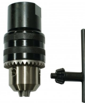
D9501 Drill Chuck & Adaptor