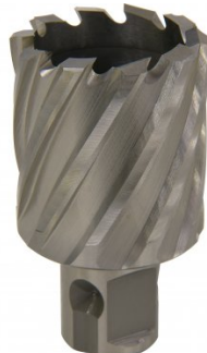
D9535 HSS Drill Broach Cutter