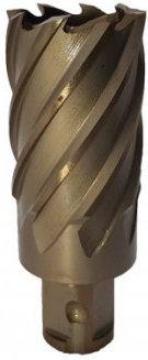
D932A HSS-Co (5% Cobalt) Drill Broach Cutter