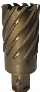
D935A HSS-Co (5% Cobalt) Drill Broach Cutter