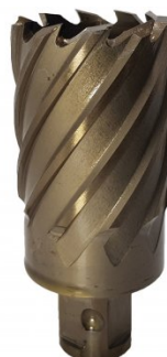
D936A HSS-Co (5% Cobalt) Drill Broach Cutter