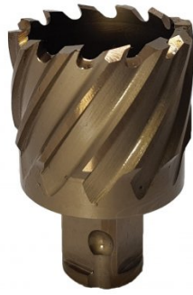
D939 HSS-Co (5% Cobalt) Drill Broach Cutter