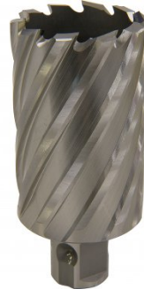
D9578 HSS Drill Broach Cutter