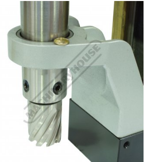
Shown with Optional Broach Cutter