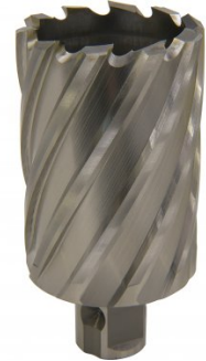
D9580 HSS Drill Broach Cutter