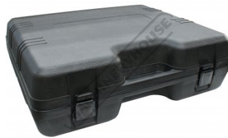
Durable Plastic Case