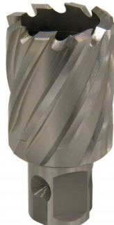
D9530 HSS Drill Broach Cutter