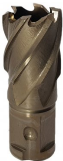
D922 HSS-Co (5% Cobalt) Drill Broach Cutter