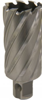
D9572 HSS Drill Broach Cutter