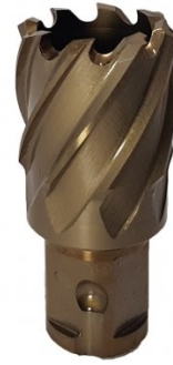
D928 HSS-Co (5% Cobalt) Drill Broach Cutter