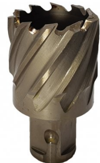
D935 HSS-Co (5% Cobalt) Drill Broach Cutter