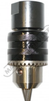
Includes Drill Chuck