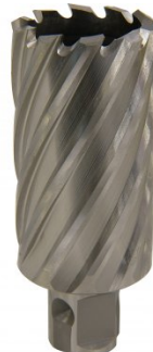
D9574 HSS Drill Broach Cutter