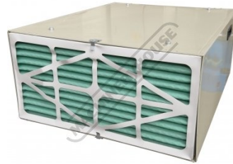
5 Micron Outer Paper Filter