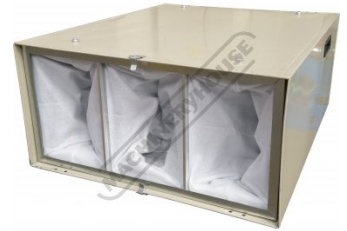
1 Micron Inner Fabric Bag Filter