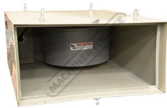
Shown with Filters Removed