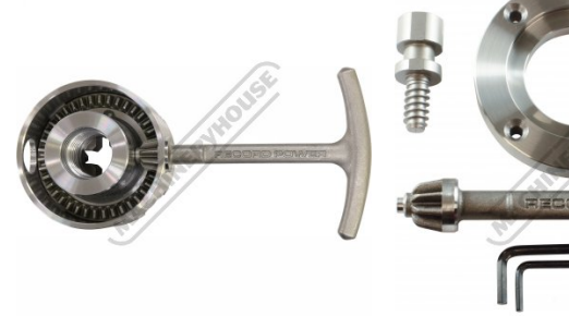
Shown With Faceplate Ring 62572 Precision Engineered Scroll and Chuck Key Parts