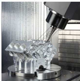
VCF850 Engine Block