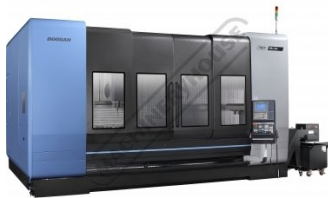
VCF 850L Closed