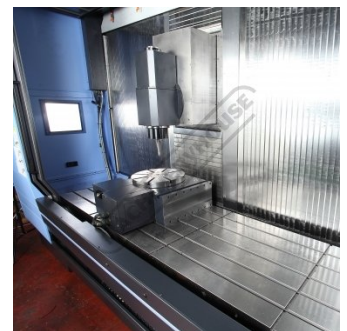
VCF850L 5 Axis