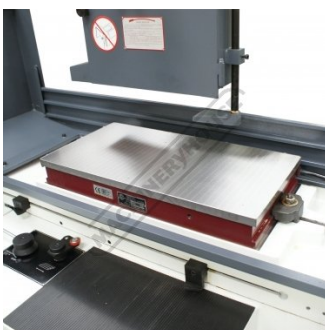
Electro Magnetic Chuck