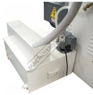
Coolant Pump & Tank