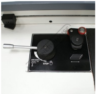
Hydraulic Table Feed Control