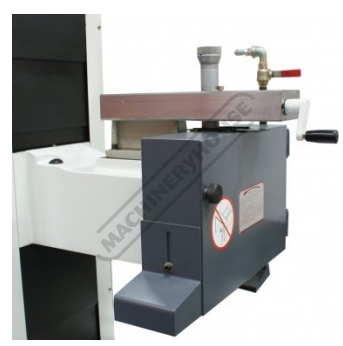
Micro Adjustment Wheel Dresser