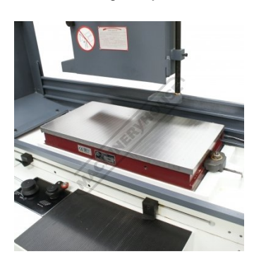
Electro Magnetic Chuck