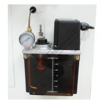
Auto Lubrication Pump