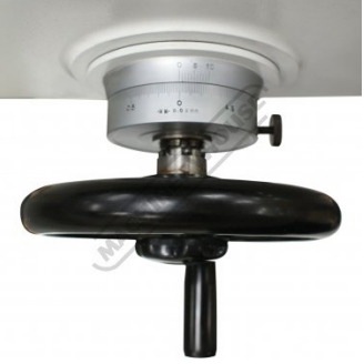
Cross Feed Dial