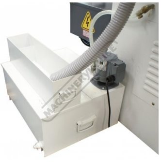
Coolant Pump & Tank