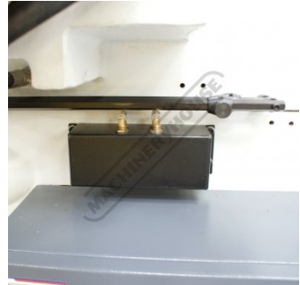
Table Direction Micro Switches