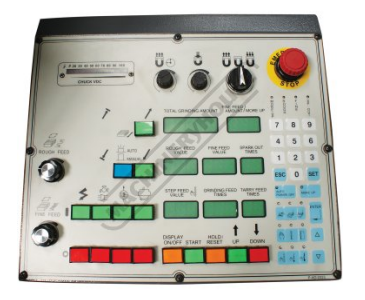
Programmable AD5 Controller