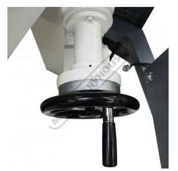
Fine Feed Height Adjustment Dial