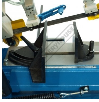
Vice At 0 Degrees