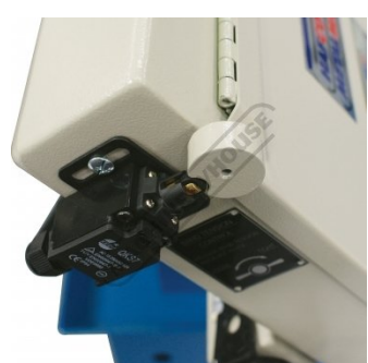
Blade Guard Safety Micro Switch on Left Side