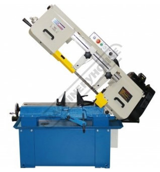
Front View Head Fully Up