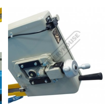
Blade Tension Mechanism