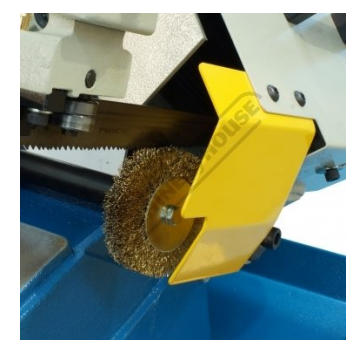
Blade Cleaning Brush