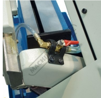
Coolant Shut Off Valve