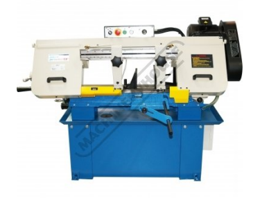
Front View Head Fully Down