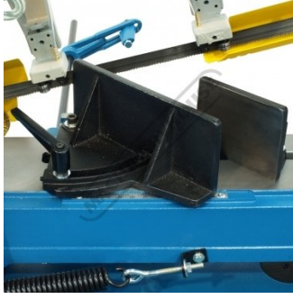
Vice At 45 Degrees