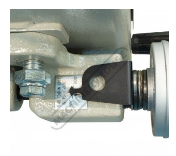
Blade Tension Scale