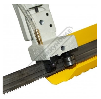
Quick Adjustment Blade Guide System Carbide Blade Guides With Bearings