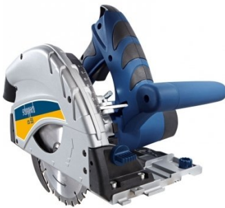
W875 Circular Plunge & Mitre Cut Saw