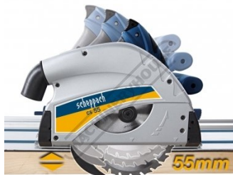
55mm maximum stepless cutting depth