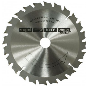
W879 Saw Blade - 160mm x 24T