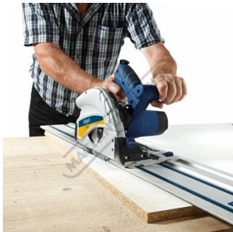
Achieve cuts usually performed on a panel saws