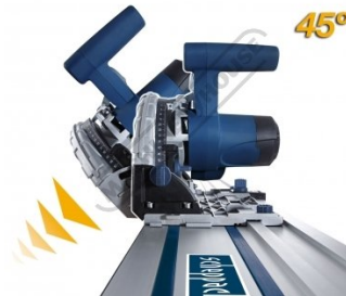
Adjustable mitre cuts 0-45 degree