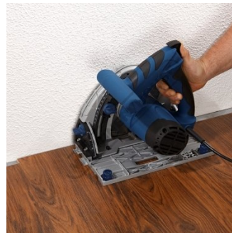
Ideal for edging up to 15.5mm from the wall