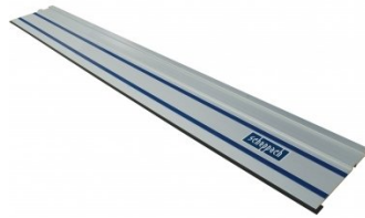
W876 Aluminium Guide Rail