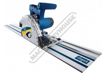
Saw in up right position show on guide rail