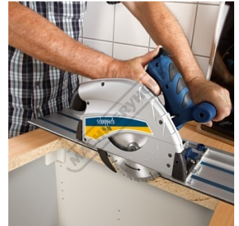
Perfect for kitchen worktops