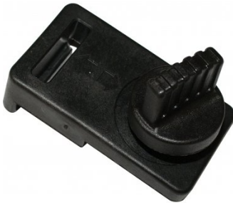
W878 Anti-Fall Over Saw Clamp