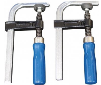
W8775 Heavy Duty Clamp Set