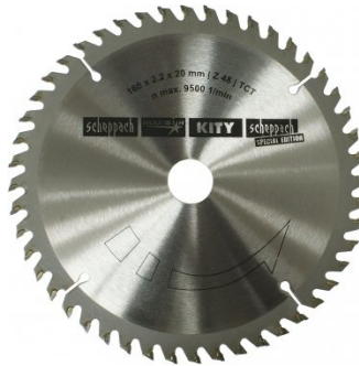
W880 Saw Blade - 160mm x 48T