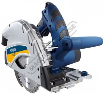
Circular plunge cut saw