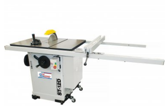
W455 Table Saw