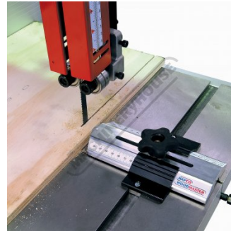
Shown In Use on Bandsaw