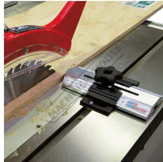
Shown In Use on Table Saw