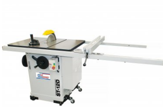
W454 Table Saw