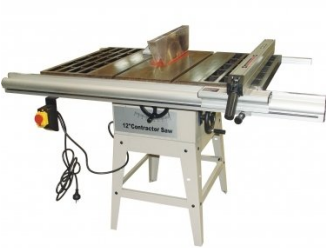
W452 Table Saw