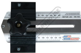
Set At Minimum Adjustment