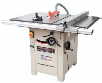
W486 Table Saw