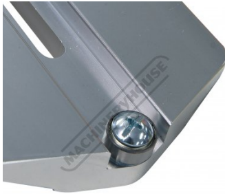
Ball Bearing For Smooth Feed