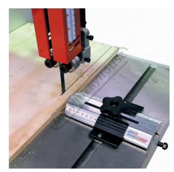
Shown In Use on Bandsaw