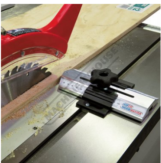
Shown In Use on Table Saw