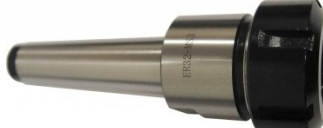
C106 Collet Chuck - R8 x ER32