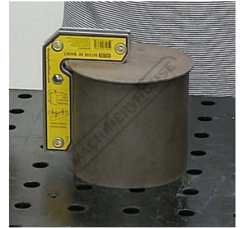
Shown in Use