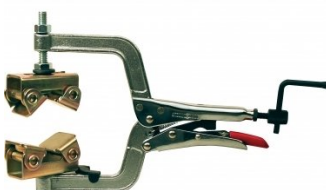
W1015 Pipe Plier