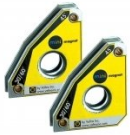
W1009 Mini Magnet Squares - (2-Pack)