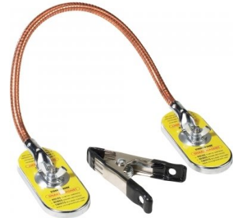
W1005 Snake Magnet & Spring Clamp