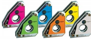
W1008 Mini Magnet Squares - (6-Pack)