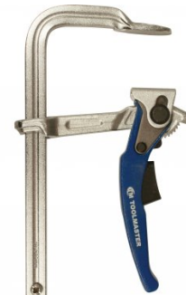
C0010 Ratchet F Clamp