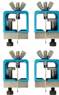
W113 Butt Welding Aluminium & Steel Clamp Set