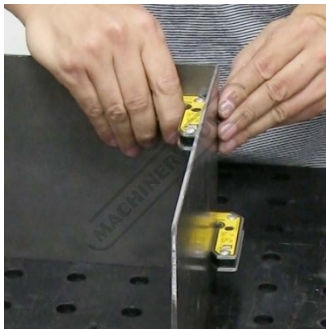
Shown in Use 2