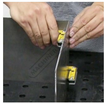
Shown in Use 2