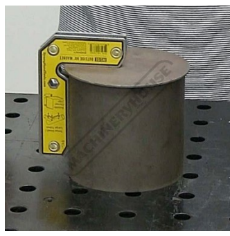
Shown in Use