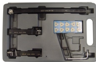
L452 Lathe Turning Tool Kit - 3 piece Insert Type