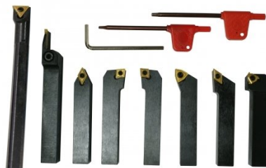
L0099 Lathe Turning Tool Kit - 7 piece Insert Type