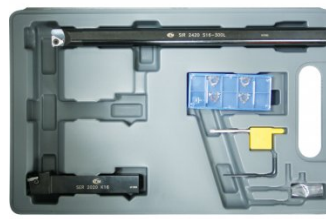
L458 Lathe Threading Tool Kit - Insert Type