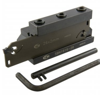
L466 Professional Lathe Parting Tool Kit - Insert Type