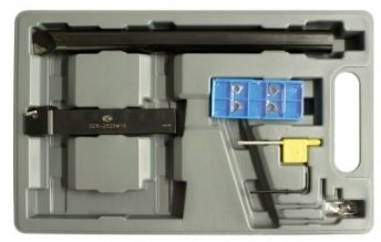
L459 Lathe Threading Tool Kit - Insert Type