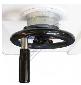
Cross Feed Dial