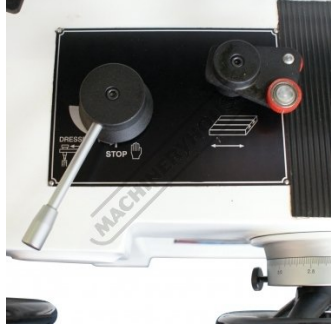
Hydraulic Table Feed Control with Rapid