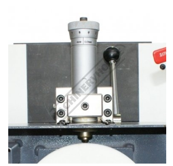
Parallel Wheel Dresser