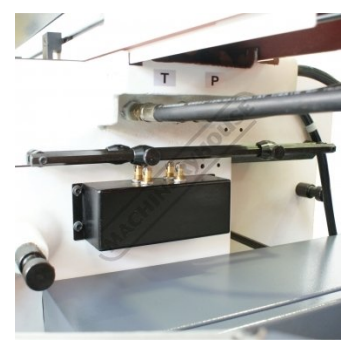
Table Direction Micro Switches