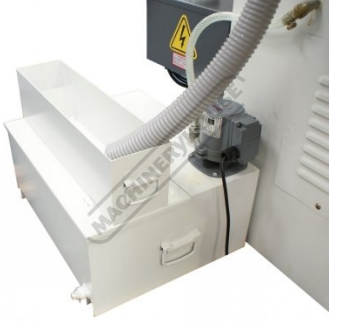
Codant Pump & Tankspan dass-Test-danger SBad Chaasters in Filename 13 Codant Pump & Tankipgr', Please debte, rename lik in DTP and re-upload 'stpan>