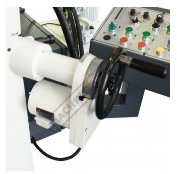
Fine Feed Height Adjustment Dial