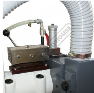
Parallel Wheel Dresser Micro Adjustment Spindle