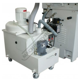
Optional Dust Collection System