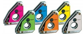
W1008 Mini Magnet Squares - (6-Pack)