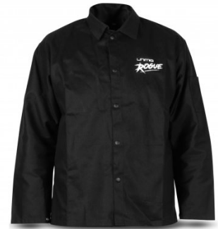
W1003 ROGUE™ PROBAN® Welding Jacket