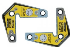
W1010 Corner Magnets - (2-Pack)