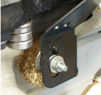
Blade Guide Wire Brush