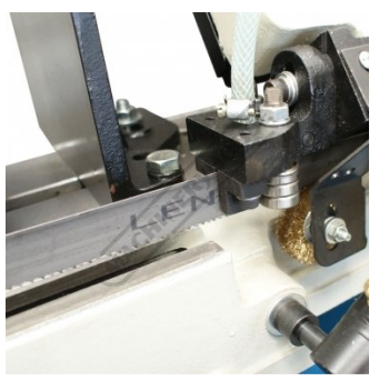
Bearing Blade Guide