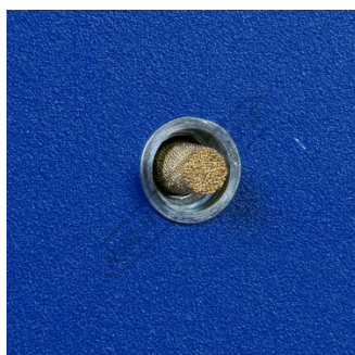
Inlet Spark Arrestor