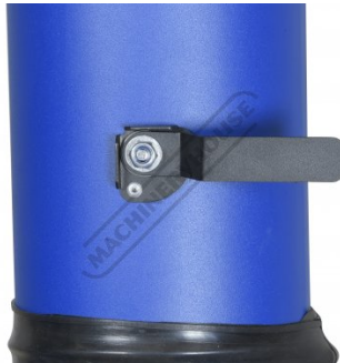
Air Flow Control Valve