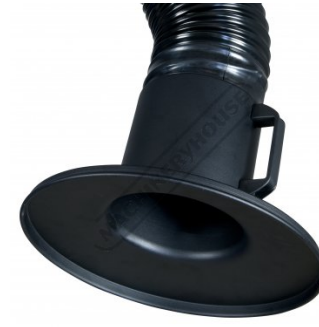
Fume Extraction Head