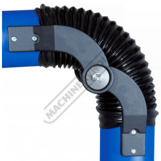
Exo Centre Arm Joint