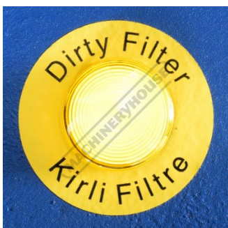
Dirty Filter Light Indicator