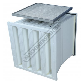
Pre Filter & Hepa Filter System