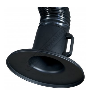
Fume Extraction Head