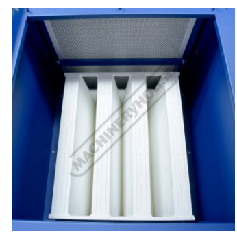
H13 Hepa Filter Assembly