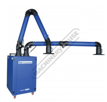
3 Metre Arm Extended