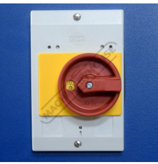
Power Isolation Switch