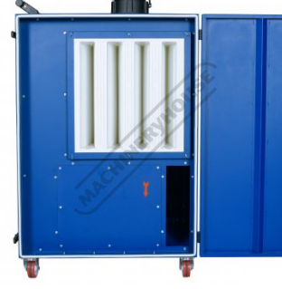
Right Side Door Access Panel