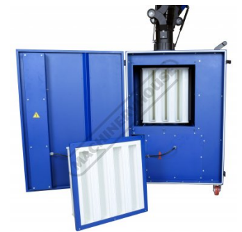
Dual H13 Hepa Filter