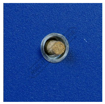
Inlet Spark Arrestor