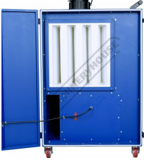
Left Side Door Access Panel