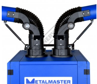
Dual Exo Joint with Gas Strut Supports