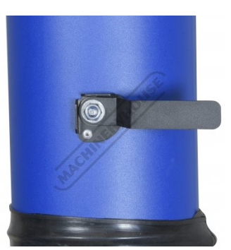
Air Flow Control Valve