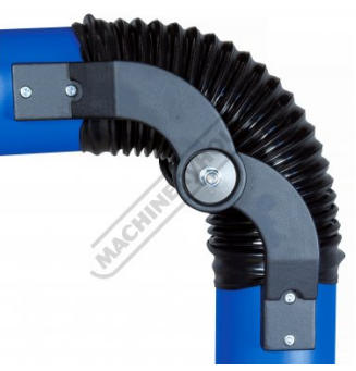
Exo Centre Arm Joint