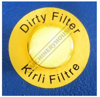
Dirty Filter Light Indicator