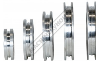
Square Formers Side View