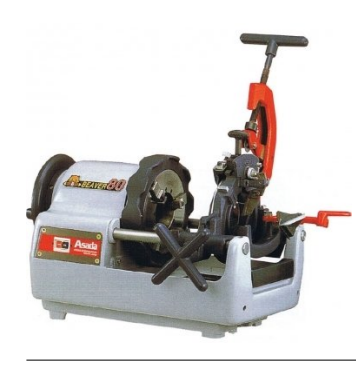
T024A Pipe Threading Machine -Automatic Die Head